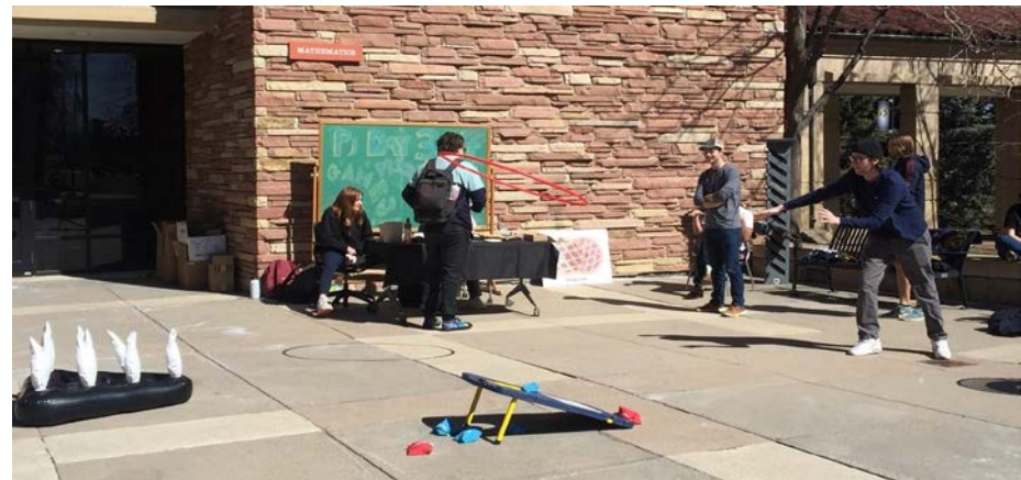
The Department sponsored its annual Pi Day celebration, serving homonymic dessert: One of our students celebrated by suspending the laws of physics!

The top three scorers all receive cash prizes from the Department of